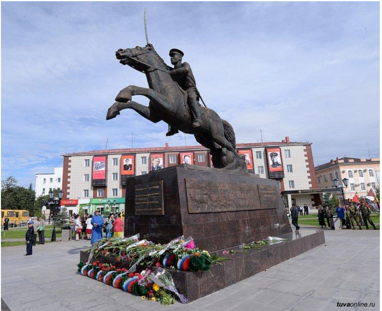
The monument to Tuvan war volunteers