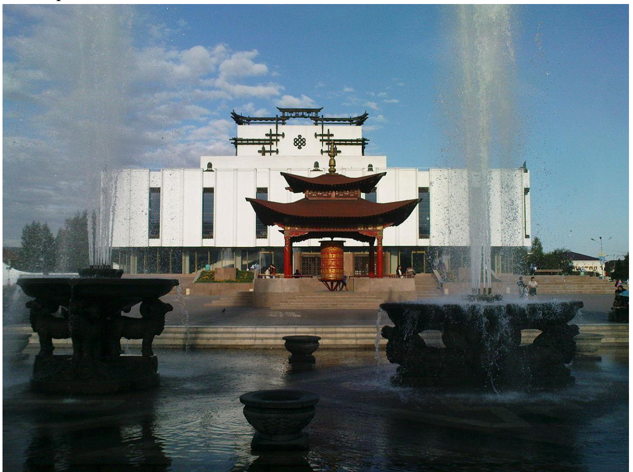
The Tuvan Musical and Drama theatre and Buddhist prayer drum

Kyzyl is famous for its educational institutions. There are many schools, lyceums, colleges in it. Tuvan State University was founded in 1952. Now the University trains specialists in different fields. It is famous for its scientists.