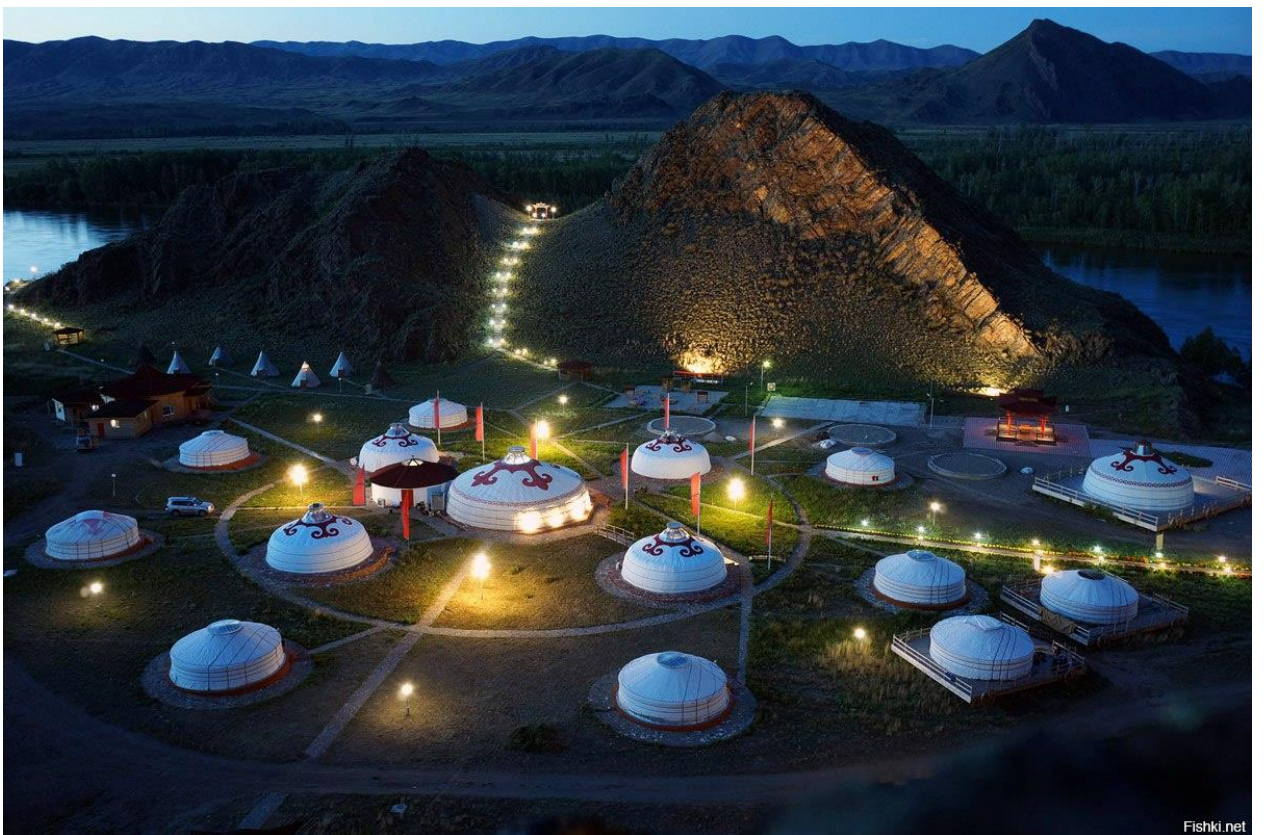
Aldyn-Bulak at night