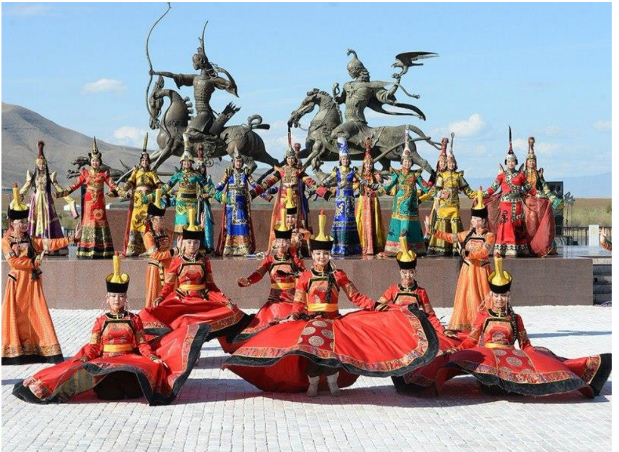
The sculptural complex “The center of Asia”