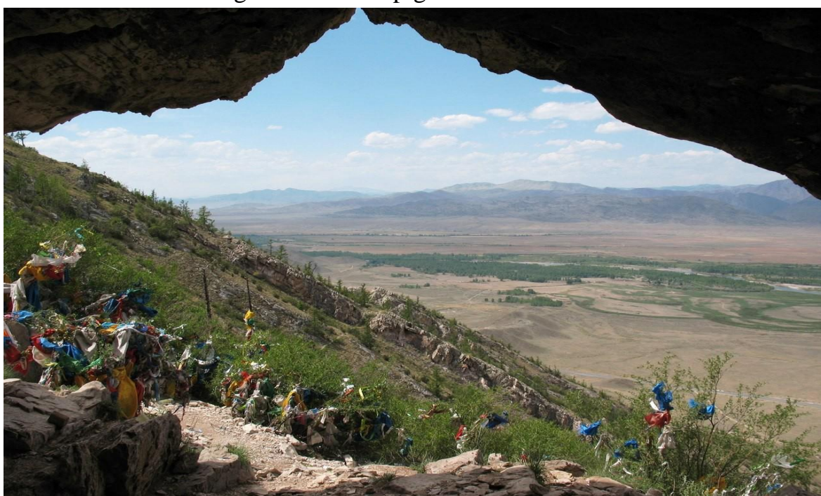
Uttug-Khaya (Peircing rock)

Ascent becomes steeper; somewhere to climb on all fours. On the rocky slopes, tenacious Karagan is growing in small hollows, next to it, accustomed to the harsh mountains, rhododendron grows. After 45-60 min all the cliffs are gone by. And here is a gaping hole. It turns out to be that it is not so small as seemed during the way. And the ridge which we have seen at the bottom, turned into a fortified wall here with height of 15 meters. At the base of this wall, there is an arch with width of 5 m and height of 3.5 meters. Cool dampness emanates from there. The course extends for 23 m through the wall. Its height is 6 m, and width of stone corridor is 11 m. Wind, heat, cold, snow, rain, sun did a hard long work to create in limestone a haven for mountain goats and wild pigeons.