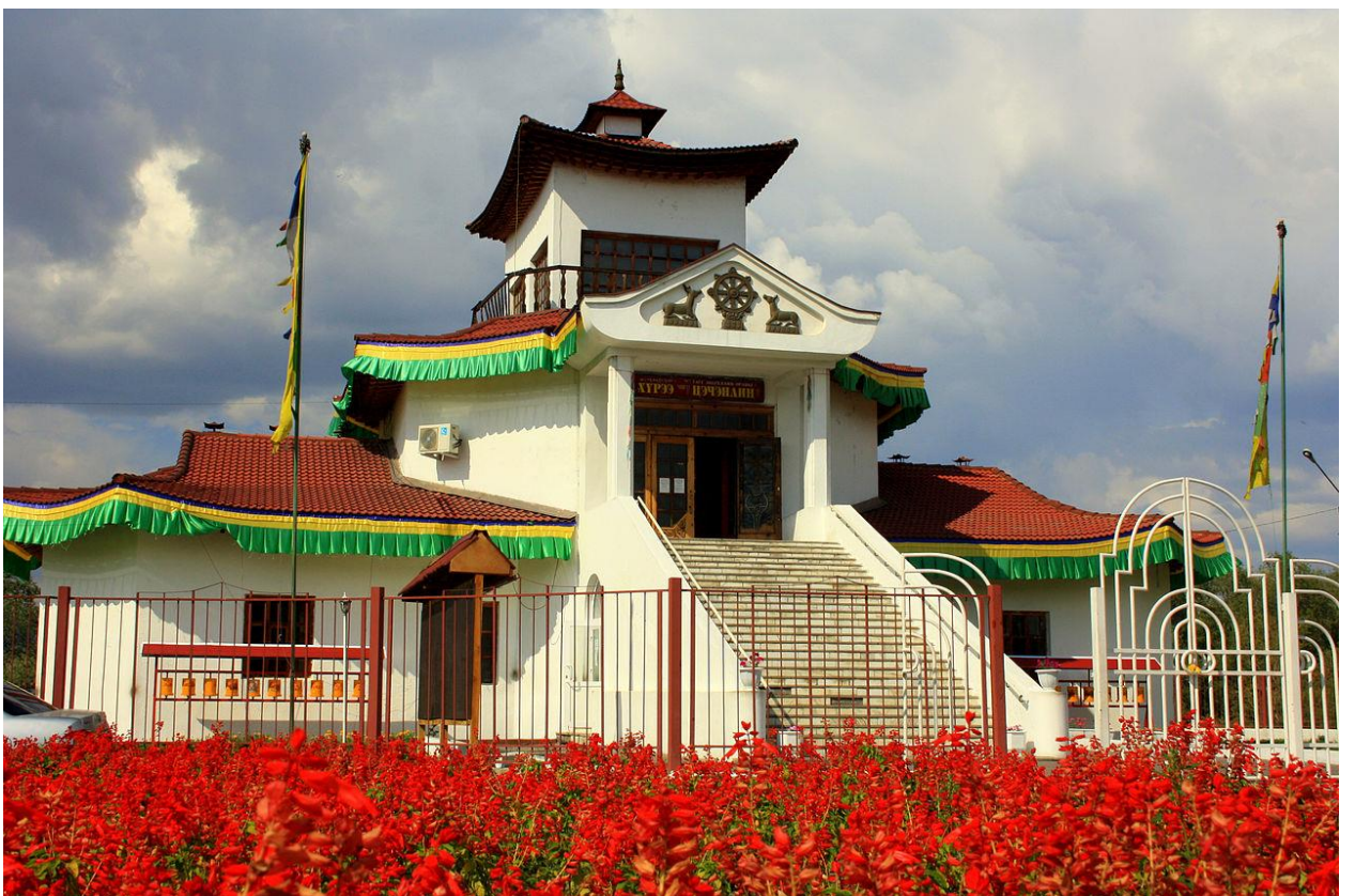
The Buddhist temple “Tsechenling”