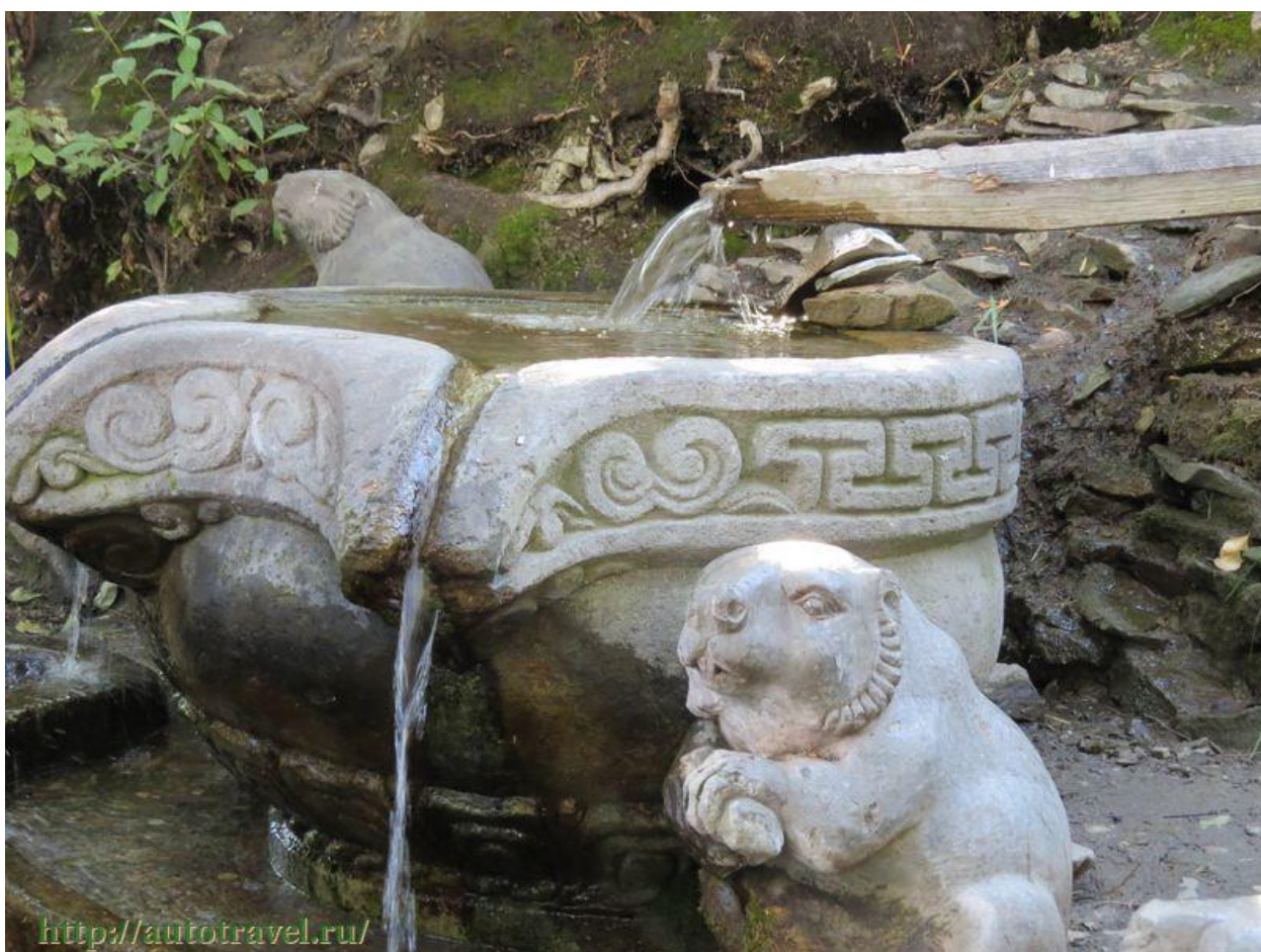
Mineral spring “Beavers”