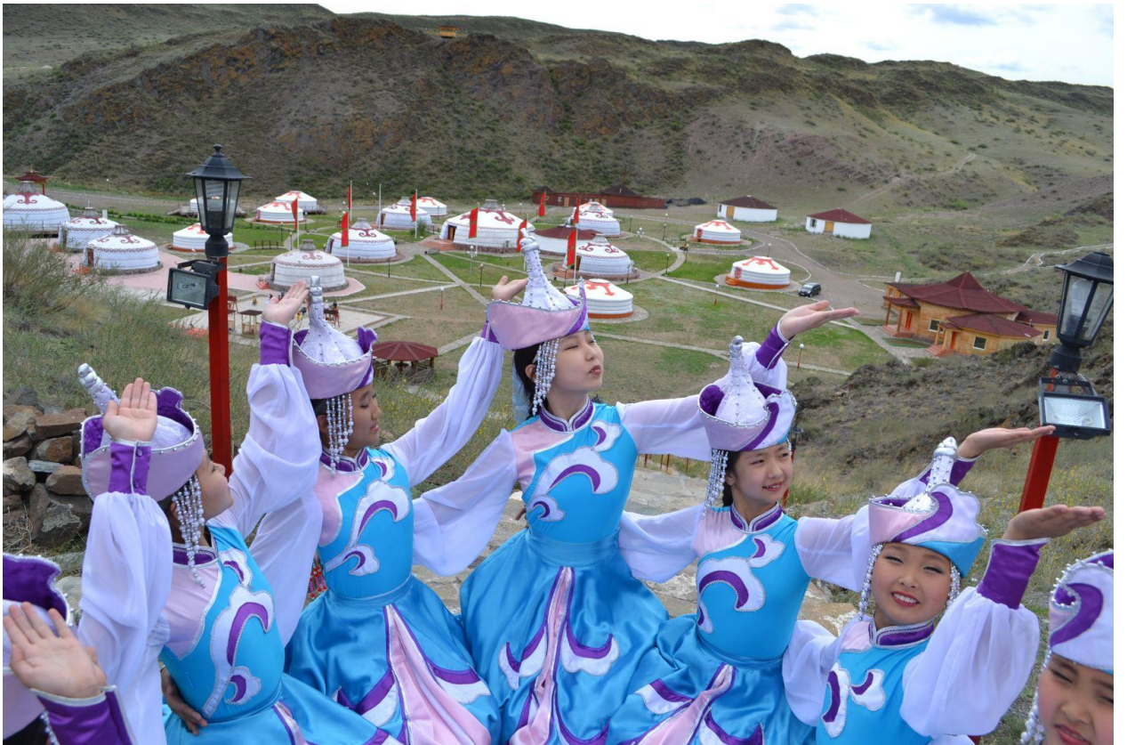
Aldyn-Bulak, ethnocultural complex